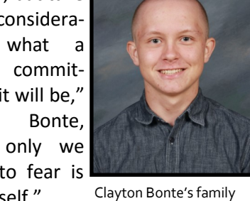
history was a contributing Six factor as to why he are enlisted in the Navy.

among many graduates from Garretson High School and other armed forces members in the Garretson Area.